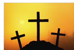
CALVARY 33 A.D.

B. We must look at what God requires under the law of Christ, not under the law at Moses!